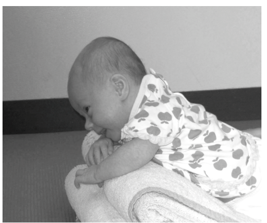
Rolled/folded towel or blanket