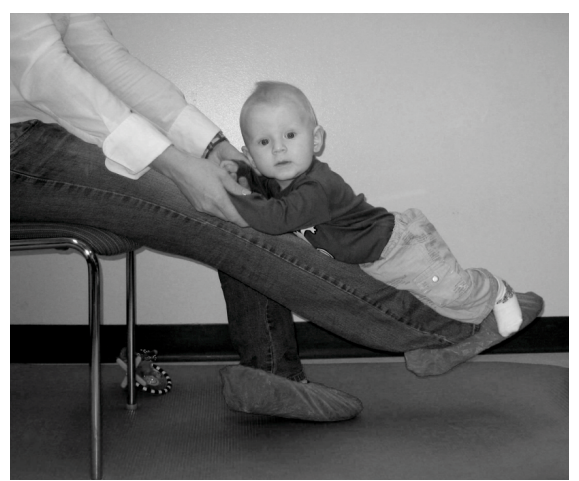
Rocking on the adults' leg/foot.

Playing aeroplanes is suitable at different ages providing you adapt the activity to suit the age of the infant.