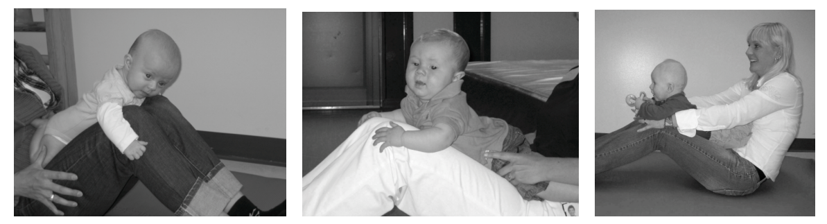
Safe positioning along the adults legs, provides a different opportunity to look around.