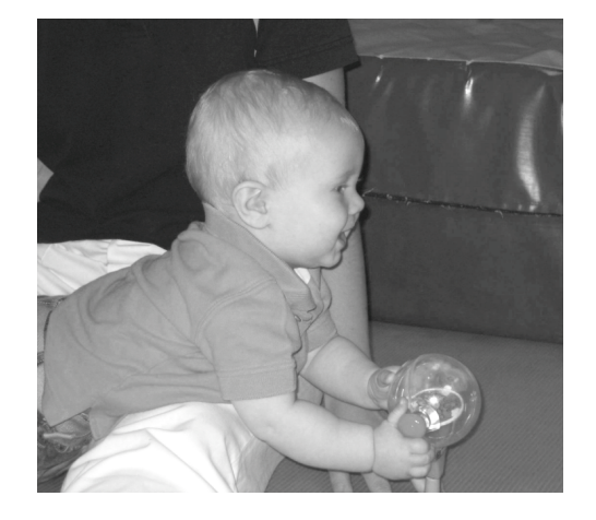
Lying over a parents leg